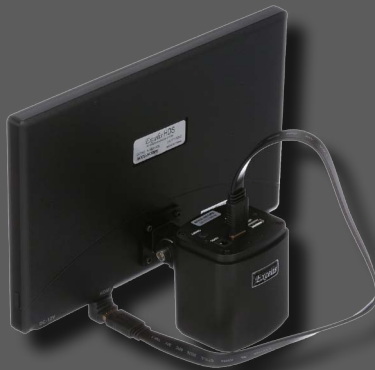
Excelis Optional 11" Monitor