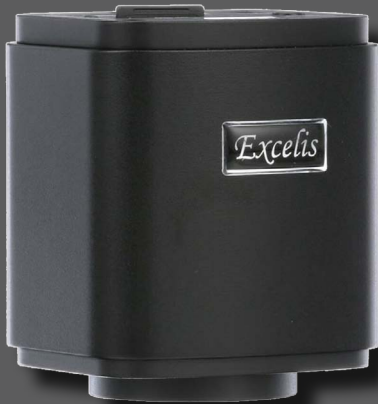
Excelis HD Camera

The Excelis HD is the only HDMI microscope camera in its class to offer simultaneous live image output to an HD monitor and to a computer via USB 2.0. Images can be saved directly to a PC or Mac or onto the included 8GB SD card. The USB microscope camera can be fully controlled without a computer. The free software allows for measurements, annotations, extended depth of focus, image stitching, and fluorescence. Please note, the Excelis camera can be purchased with or without the 11" monitor. To see a demonstration of the software, please visit Leeds YouTube page and watch: https://youtu.be/9yqGLa3q5rY