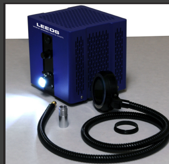
LEDFO Kit Options: LEDFO, Leeds ring light, thread adapter, and Ferule. Part #: LRL-410LEDK