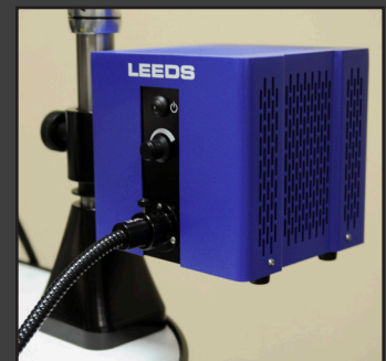
Leeds' LEDFO can be mounted on an optional post to maximize work surface space.