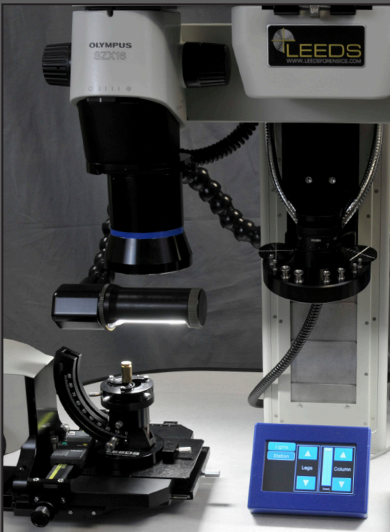
Fluorescent Quad Lamp mounted on the LCF3 Firearms and Tool Marks Comparison Microscope

The Leeds Fluorescent Quad Lamp provides bright diffuse illumination. The unique rotating hood allows examiners to control the angle of light and adjust the contrast on a sample. The Quad Lamp can be attached with an articulated arm, allowing end user to adjust and tighten joints as desired. Alternately, the Quad Lamp can be attached to the microscope mounted on obedient gooseneck tubing, with stay in place capabilities. Adjust the tubing with one hand, and the quad lamp will remain in the desired location without needed to be locked in place. These replacement lamps are quality control checked and sorted by their background color, to minimize the large color variance that can occur between individual lamps. Replacement bulbs may be purchased in pairs on our ebay store. Please click on "Ebay Store" link on our website: www.leedsmicro.com .