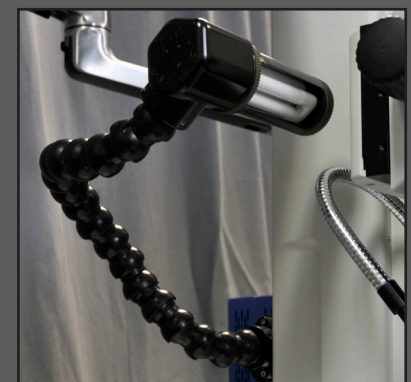
Fluorescent Quad Lamp mounted to column with flexible tube arm