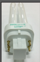
Fluorescent Quad Lamp replacement bulbs, sold in a set of 2