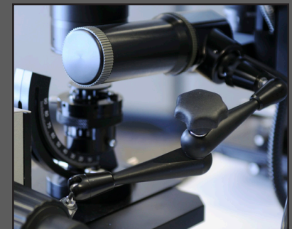
Fluorescent Quad Lamp with articulated arm, attached to Focus Mount