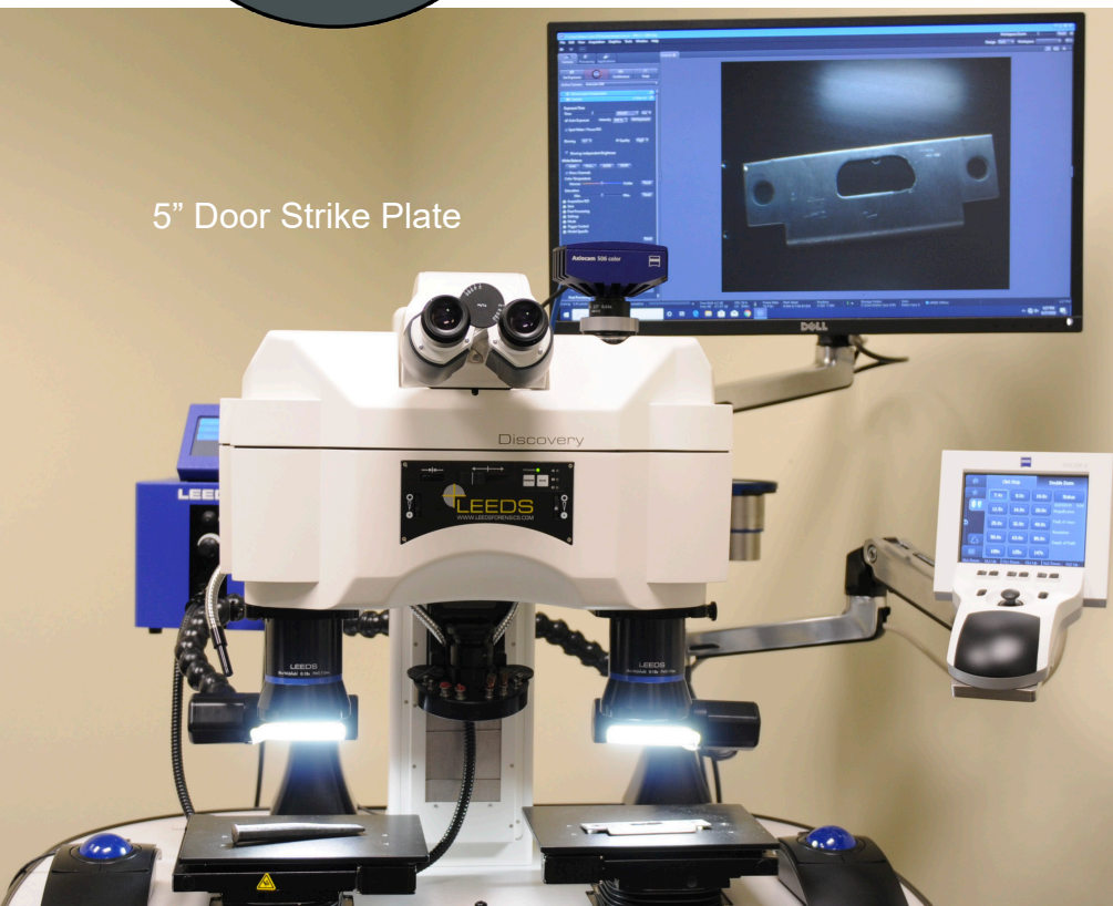
5" Door Strike Plate

Leeds Ultra-Widefield Objective, designed for our Discovery and Discovery-Z provides: