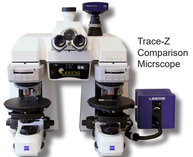
Trace-Z Comparison Microscope

In addition to the AxioScope, Leeds Trace-Z Comparison Microscope can assist drug chemists by offering a side-by-side comparison of a test drug sample placed next to a sample of an unknown drug.