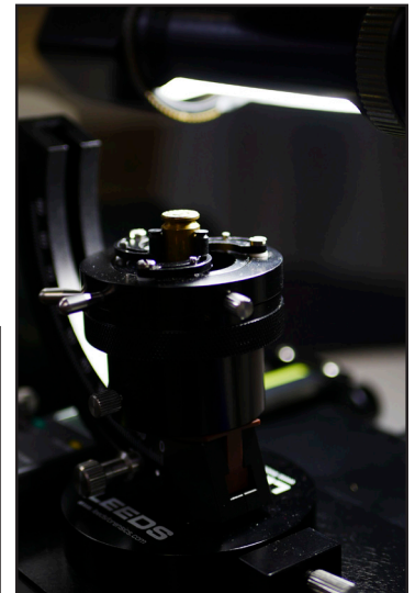
Fluorescent Quad Lamp with articulated arm, attached to Focus Mount