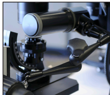
Fluorescent Quad Lamp mounted to column with flexible tube arm

Discuss your lighting needs with our knowledgeable staff: sales@leedsmicro.com