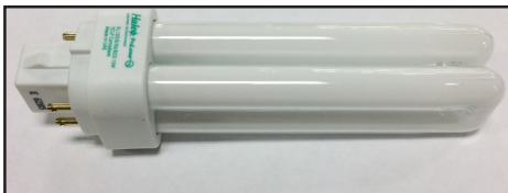
Fluorescent Quad Lamp replacement bulbs, sold in a set of 2, on Leeds' ebay store, accessible via www.leedsmicro.com