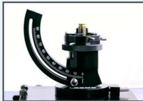
.40-cartridge casing held by the outside diameter