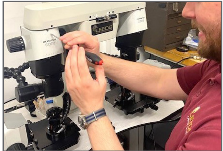
Leeds is ISO/IEC 17025:2017 accredited by PJLA.